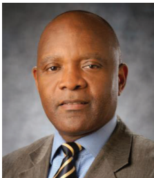
Dr. John N. Nkengasong

Director – Africa Centres for Disease Control and Prevention